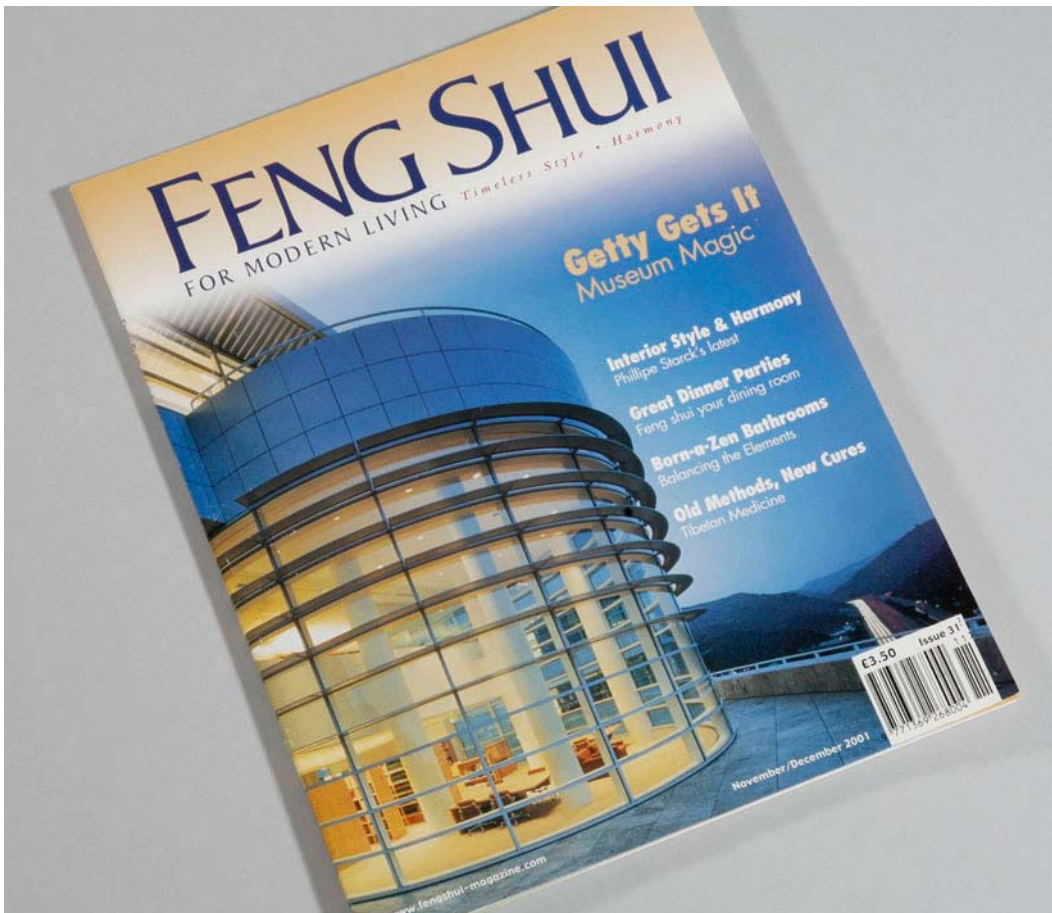
◀ Feng Shui for Modern Living magazine. Relaunch issue, front cover.