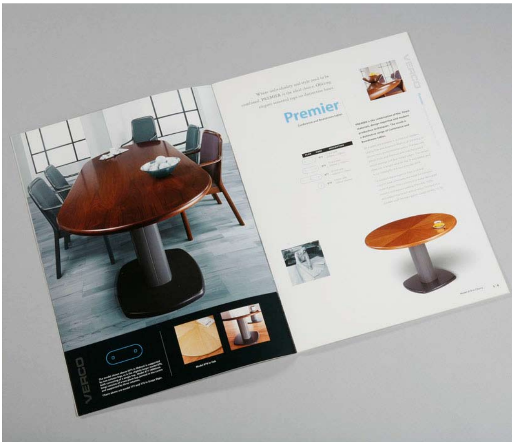
◀ Verco Office Furniture Ltd: Tables brochure. A4 16pp. Internal spread.