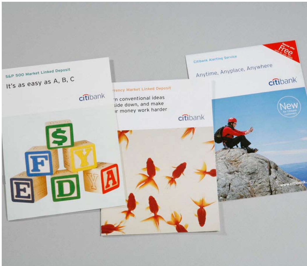
◀ Citi A5 in-branch leaflets. LEFT TO RIGHT: S&P 500 Market Linked Deposit 8pp, DJ Market Linked Deposit 8pp and Text messaging service 6pp.