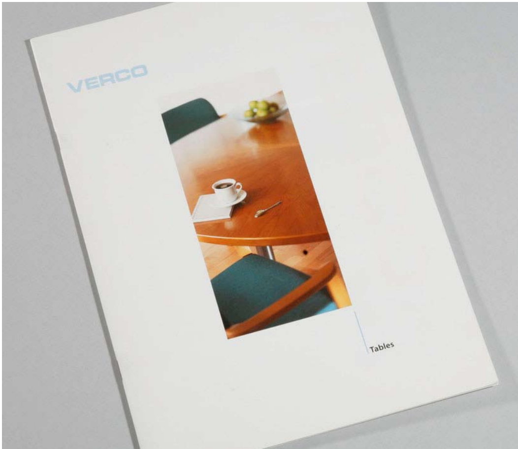
◀ Verco Office Furniture Ltd: Tables brochure. A4 16pp. The front cover has a spot varnish of the logotype on right hand side.