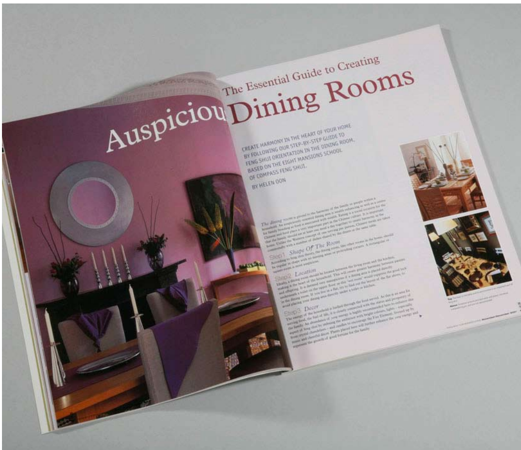
◀ Feng Shui for Modern Living magazine. Relaunch issue, internal spread.