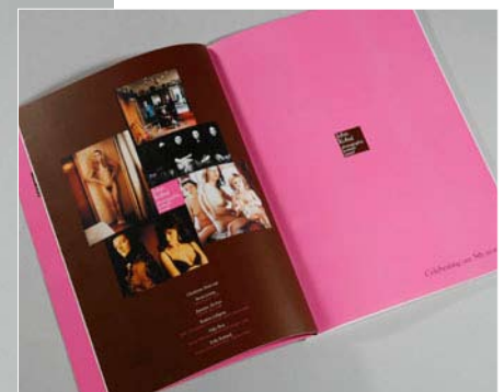
John Kobal Foundation 52pp competition exhibition catalogue for Photographic Portrait Award.