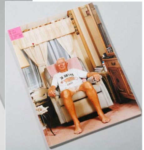
John Kobal Foundation 52pp competition exhibition catalogue for Photographic Portrait Award.