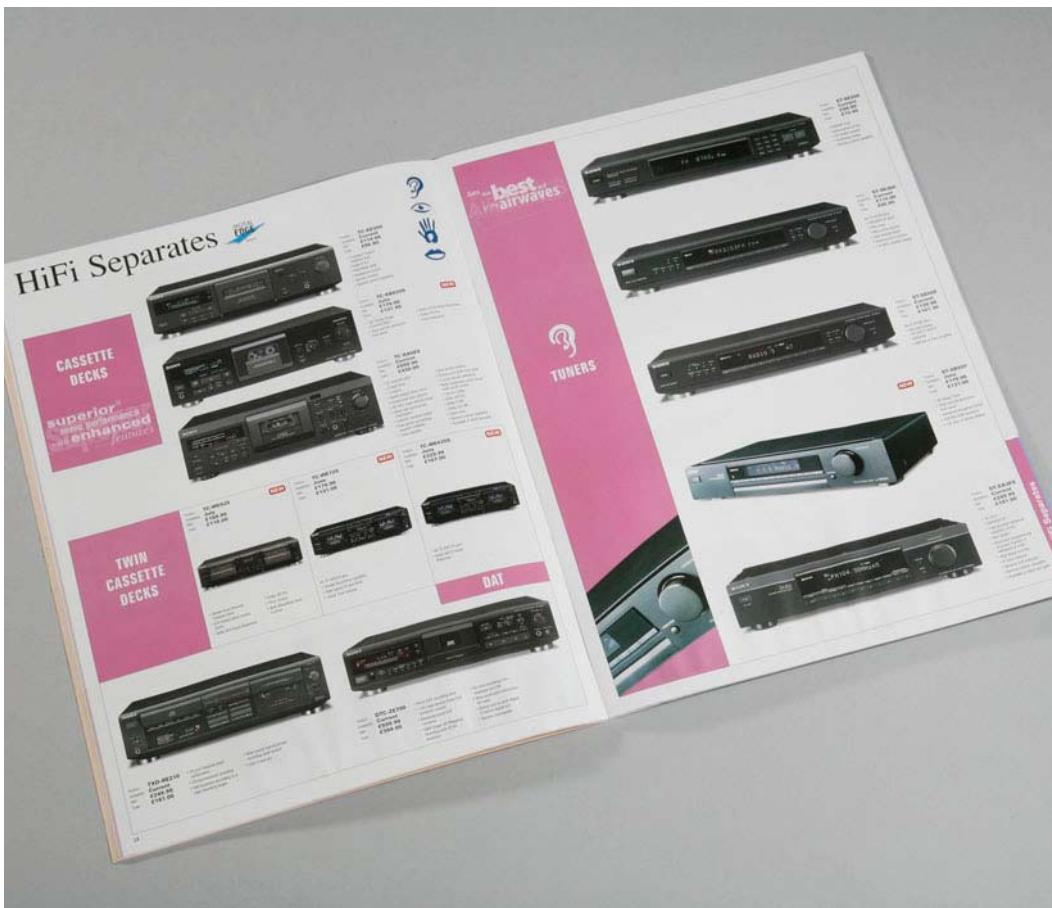
◀ Sony 52pp product catalogue brochure.