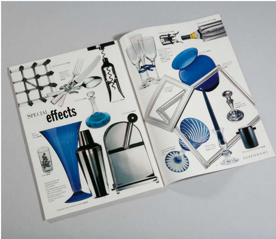
◀ Debenhams A4 96pp Christmas brochure.